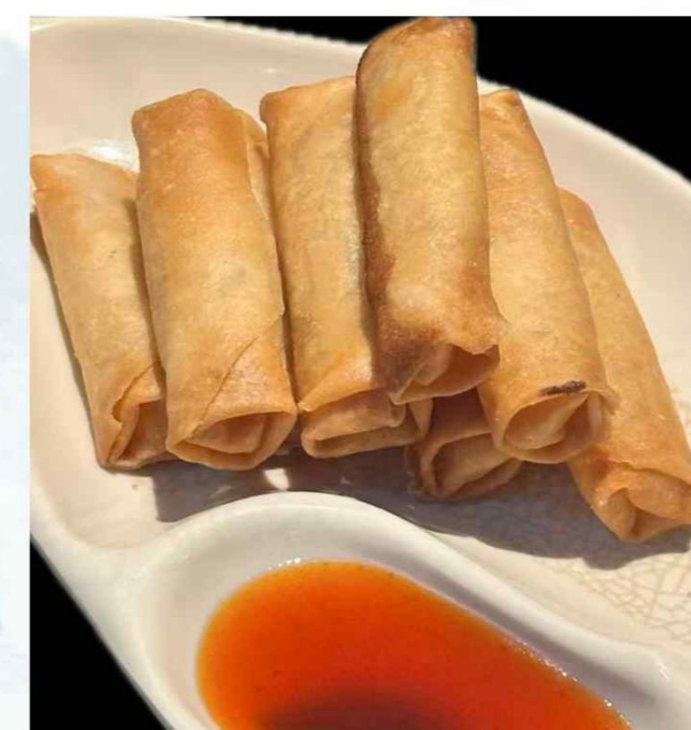
013 Spring roll (8pies) 脆炸上素卷