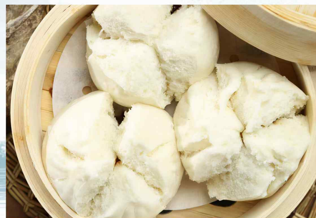
006 Chicken prawn & shitaki mushroom bun 冬菇鸡包仔