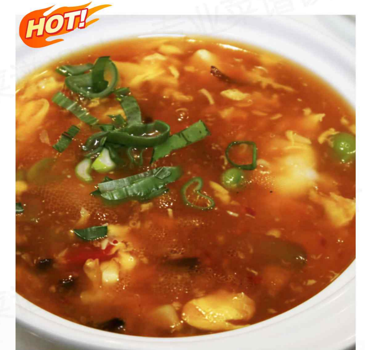
026 Spicy & sour seafood soup 酸辣海鲜汤 £ 7.50