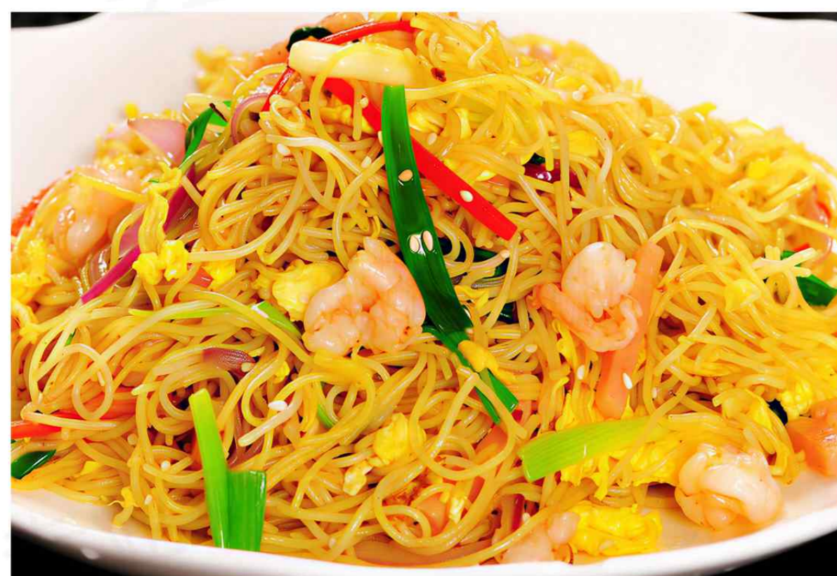
073 Singapore noodles with king prawn 大虾新洲米粉 £ 12.99