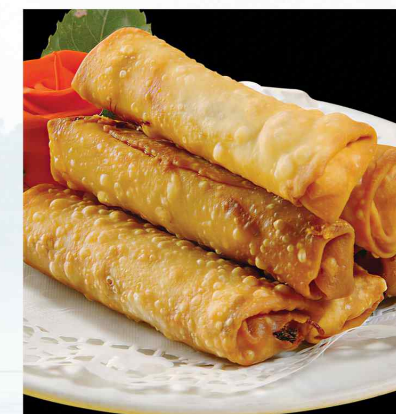
014 Crispy duck roll (5pies) 鸭卷