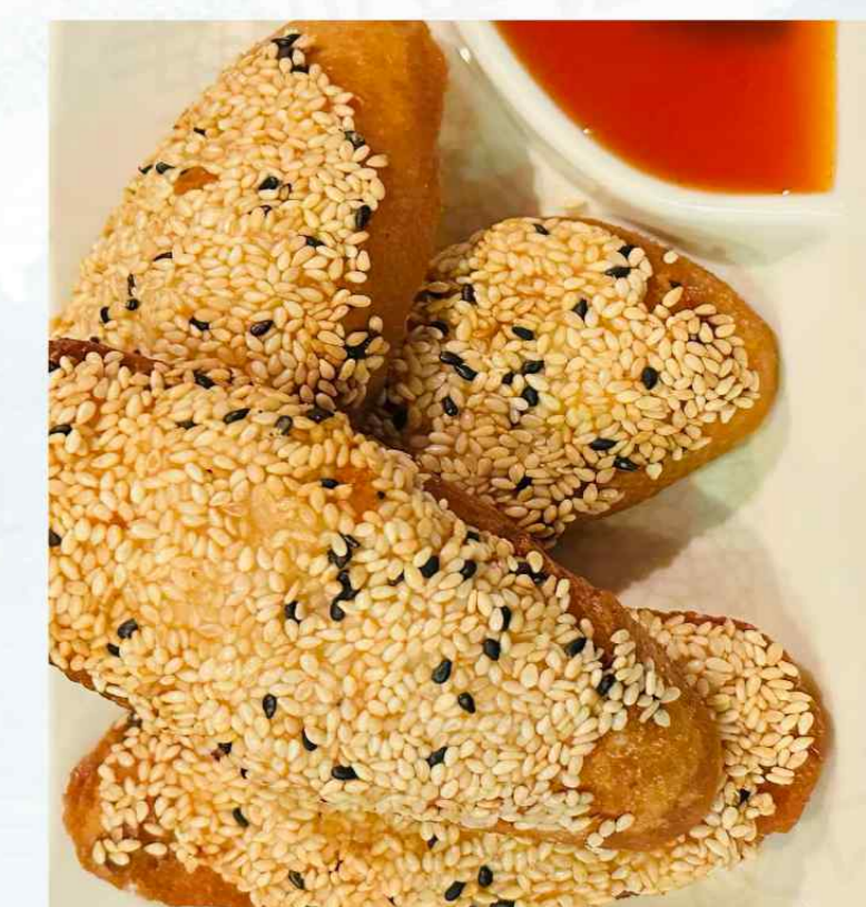
015 Sesame Prawn toast (4 pies) 法式芝麻虾