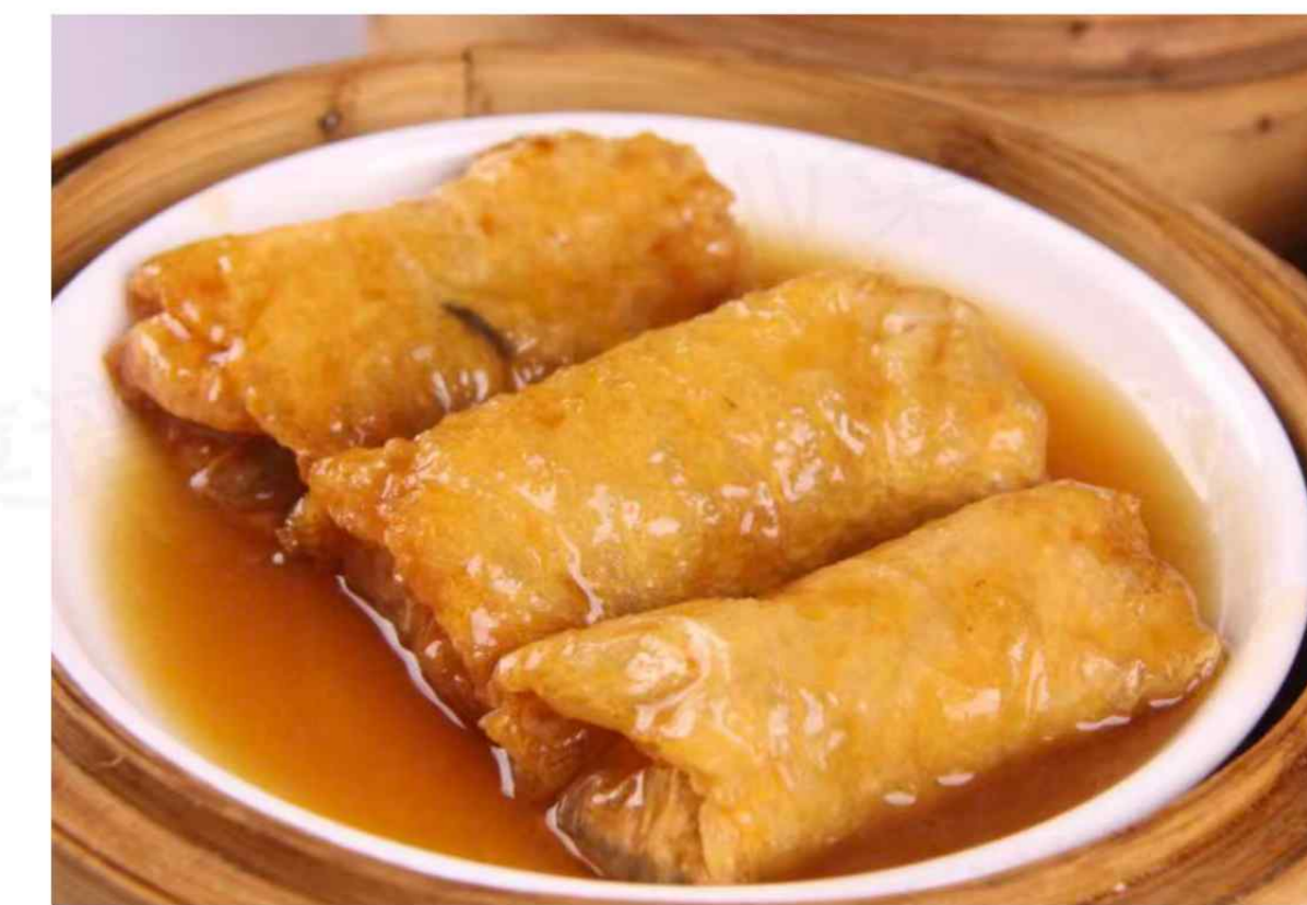
009 Chicken & prawn and bean curd rolls 蚝油鲜竹卷