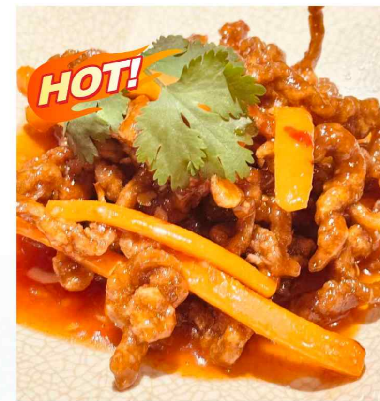
020 Fried shredded crispy beef