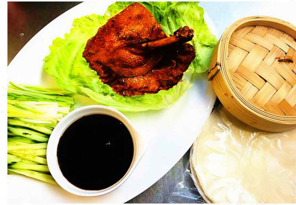
017 Crispy duck quarter / half 香酥鸭 ¼ £ 13.99 ½ £ 23.99