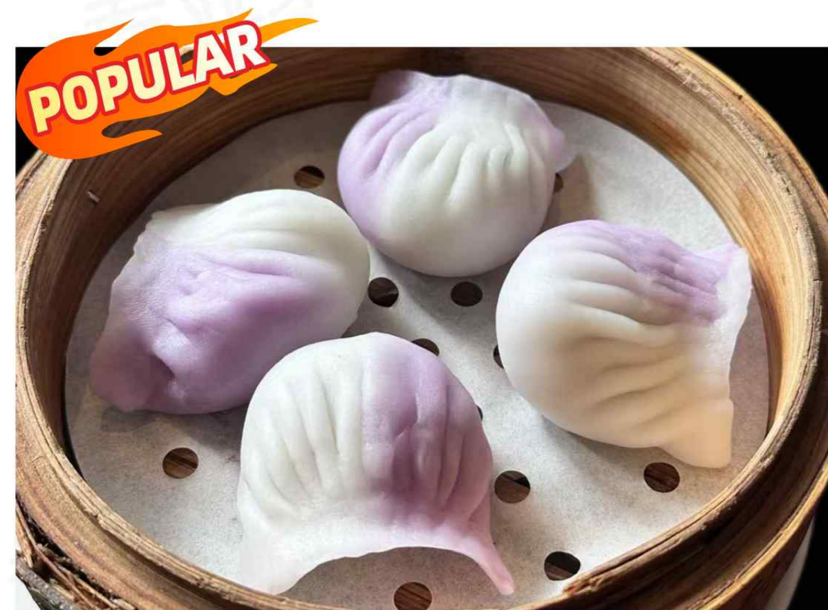
POPULAR 001 Steamed prawn dumpling 虾饺