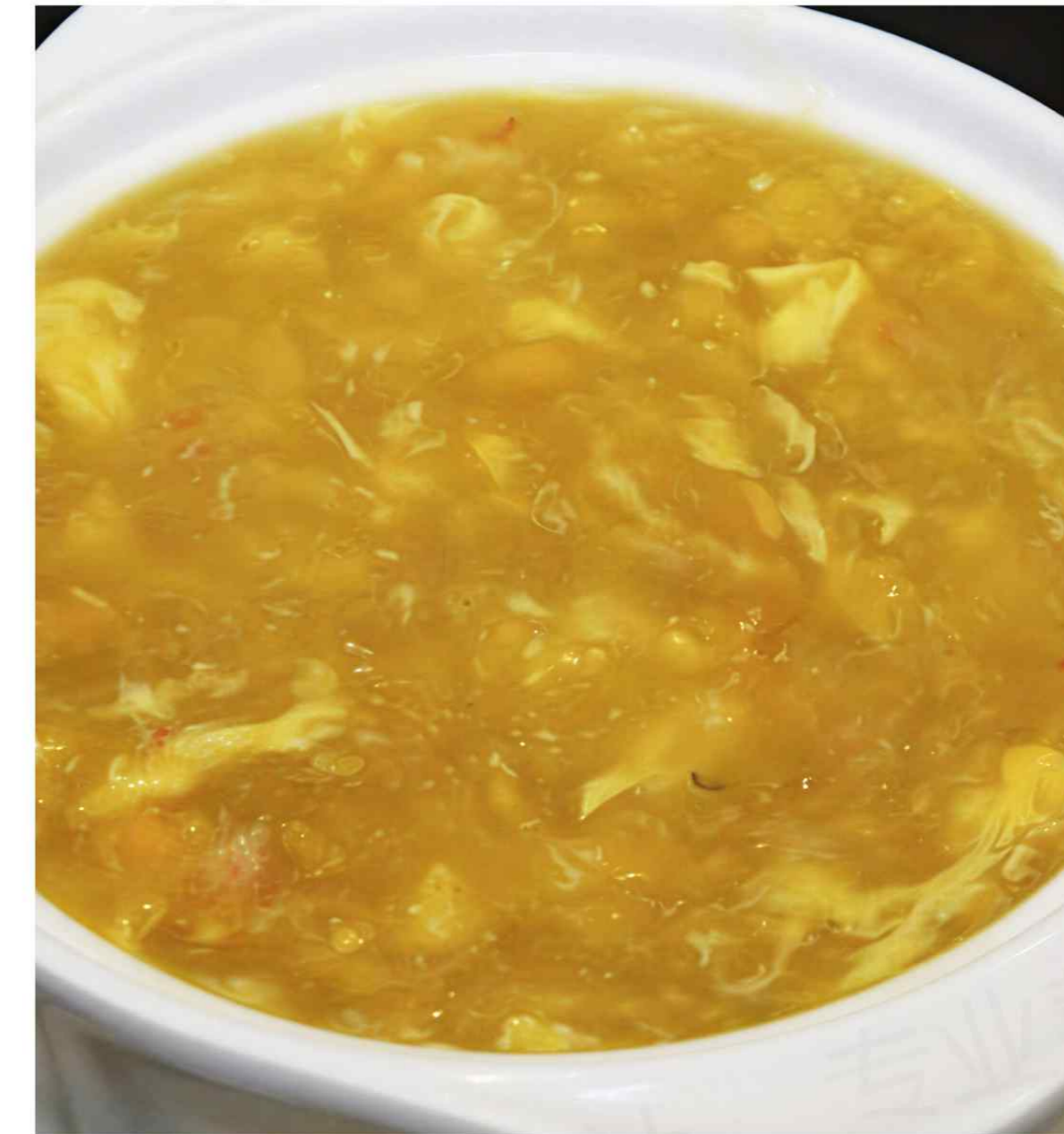
023 Crab & sweet corn soup 蟹肉粟米羹 £ 7.80