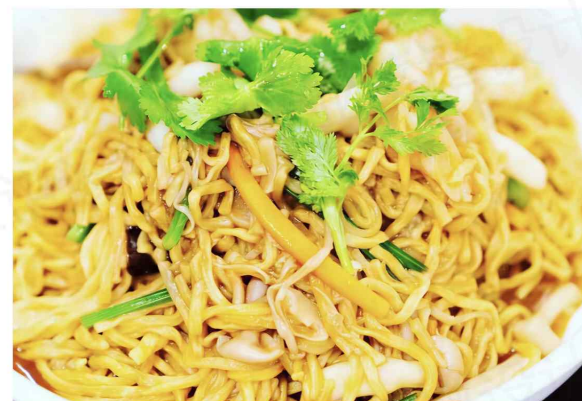
076 Seafood Braised Noodles 海鲜焖面 £ 17.99