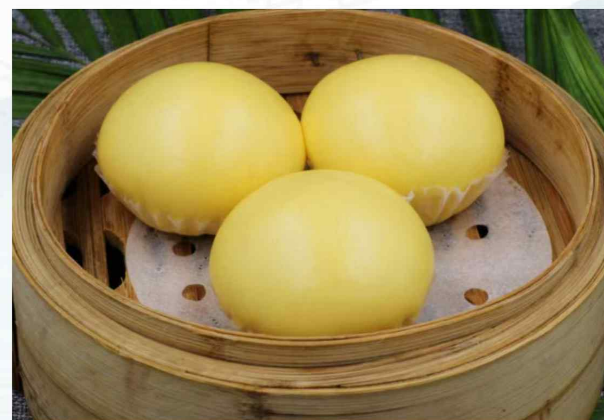
002 Carrot & salted egg yolk bun 金笋流沙包