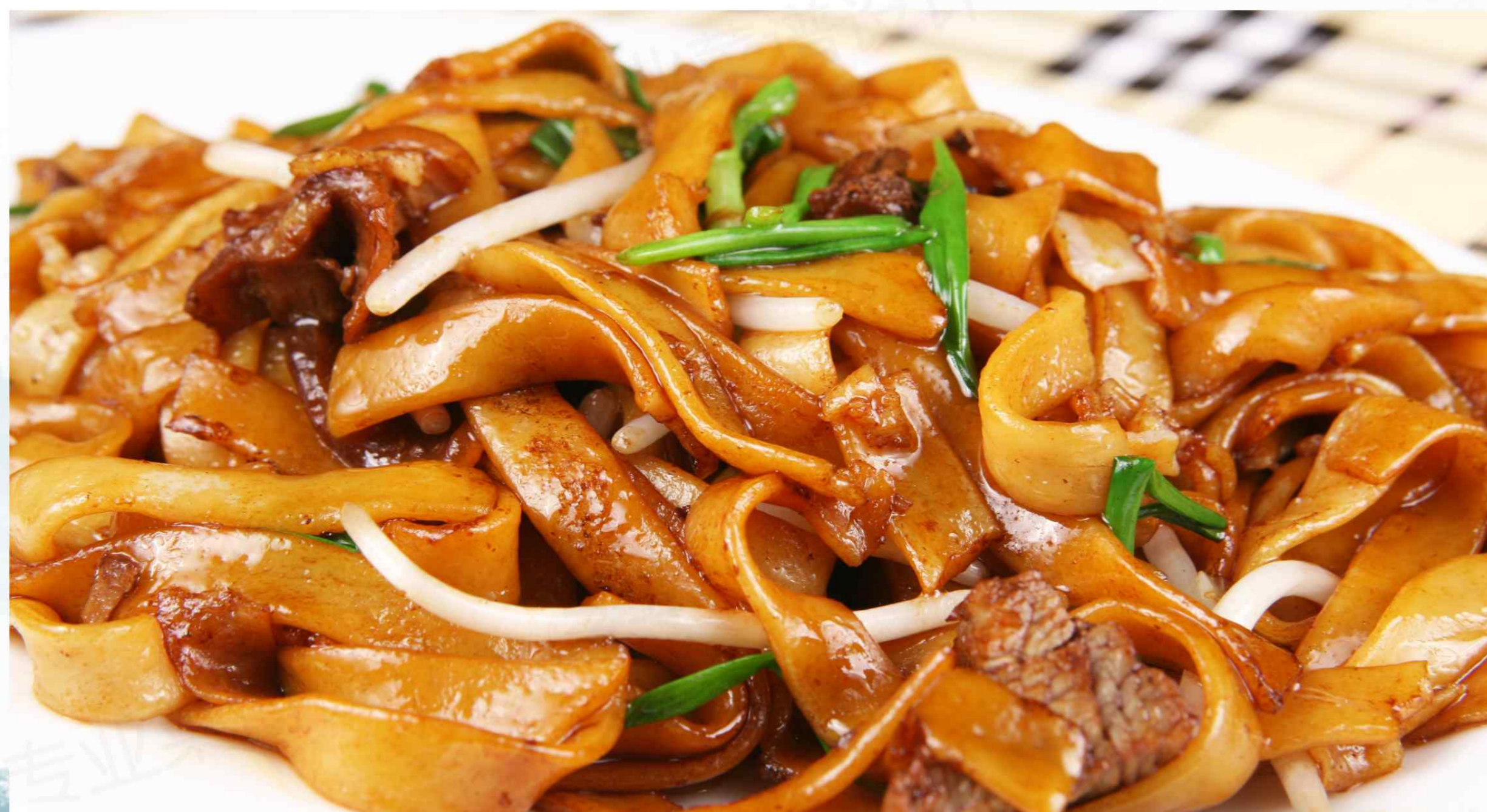
079 Beef hofun 干炒牛河 £ 14.99