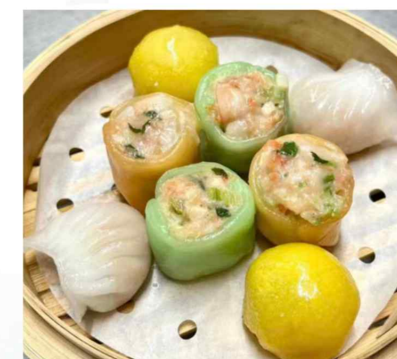
011 Mixed dimsun selection 点心拼