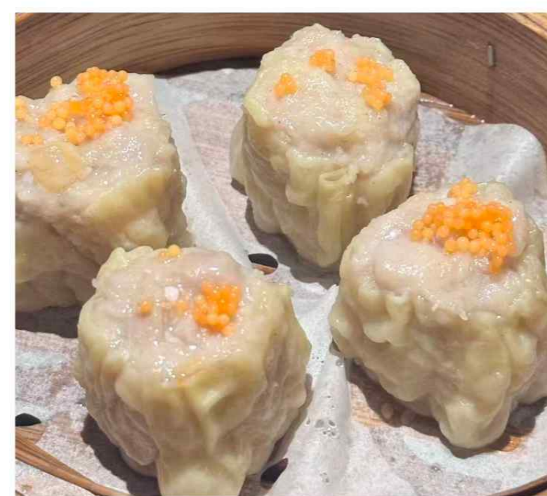
004 Chicken and prawn Siu mai 烧卖