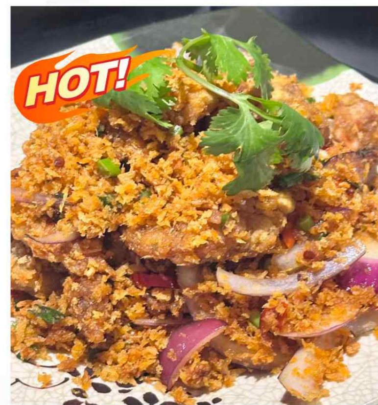
019 Crispy soft shell crab with fried garlic