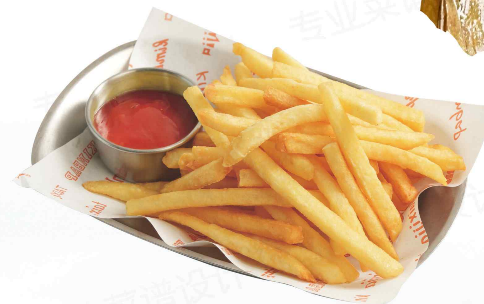
083 Chips 炸薯条 £ 3.99