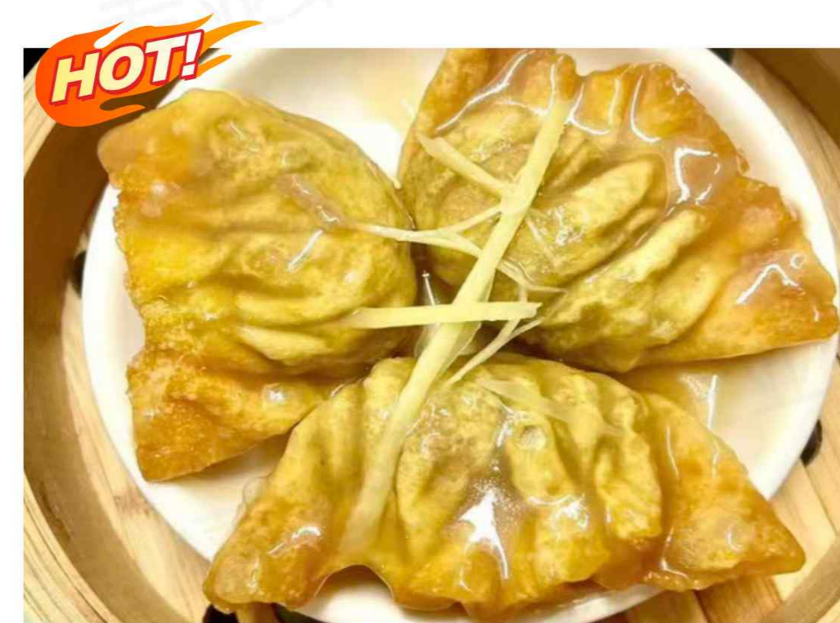
HOT! 008 Beef with ginger & onion dumpling 姜葱牛肉饺