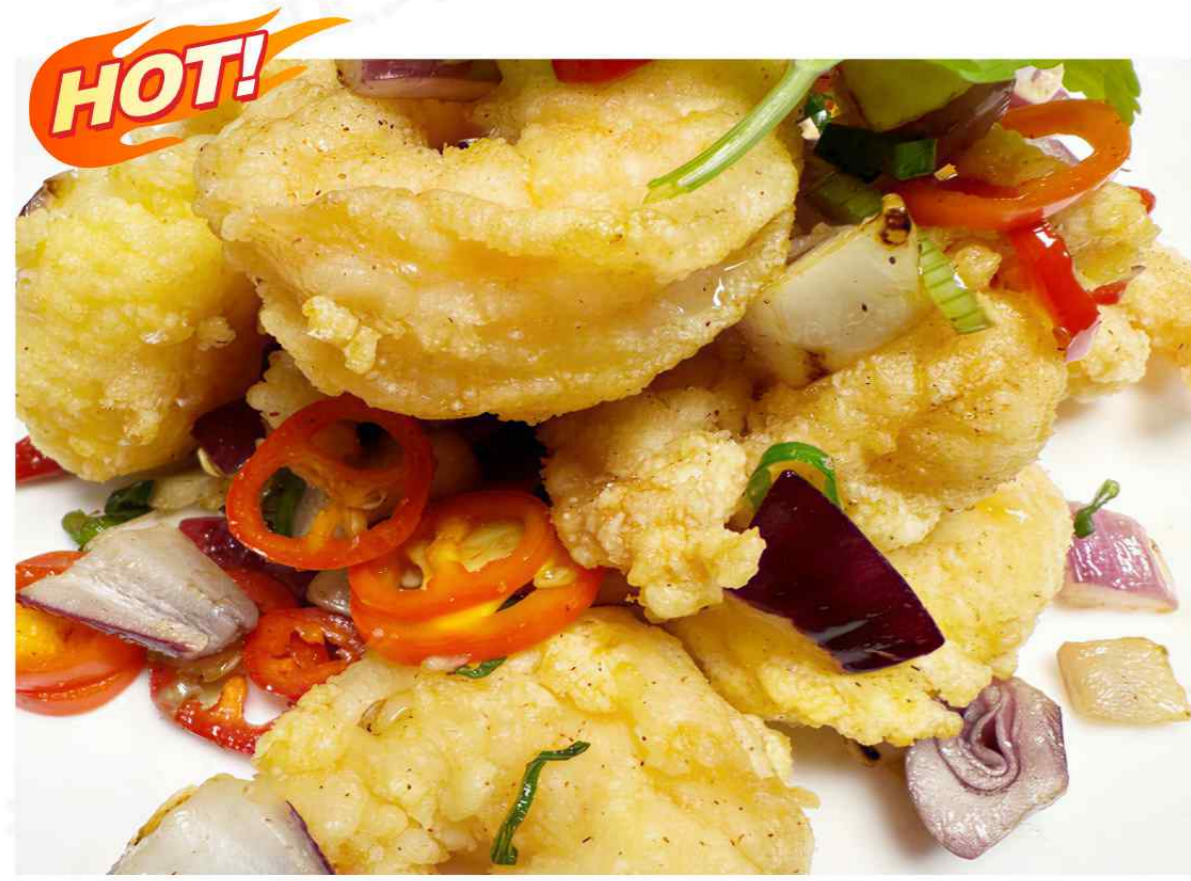
016 Salt pepper king prawn 椒盐大虾