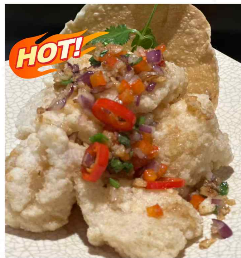
018 Salt & pepper squid 椒盐鱿鱼