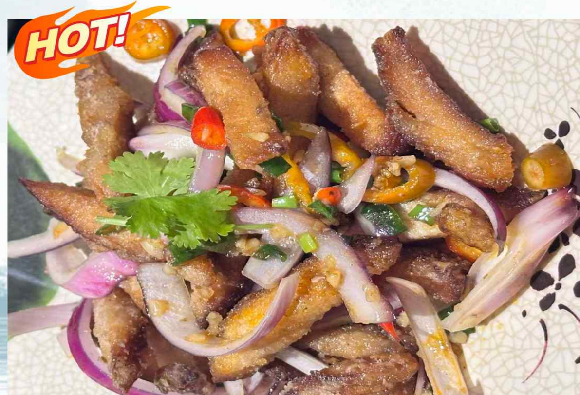
021 Salt & pepper chicken 棒棒熏鸡丝