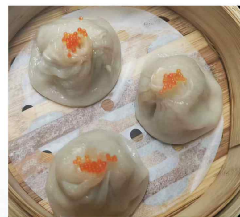
005 Xiao long bao 小笼包