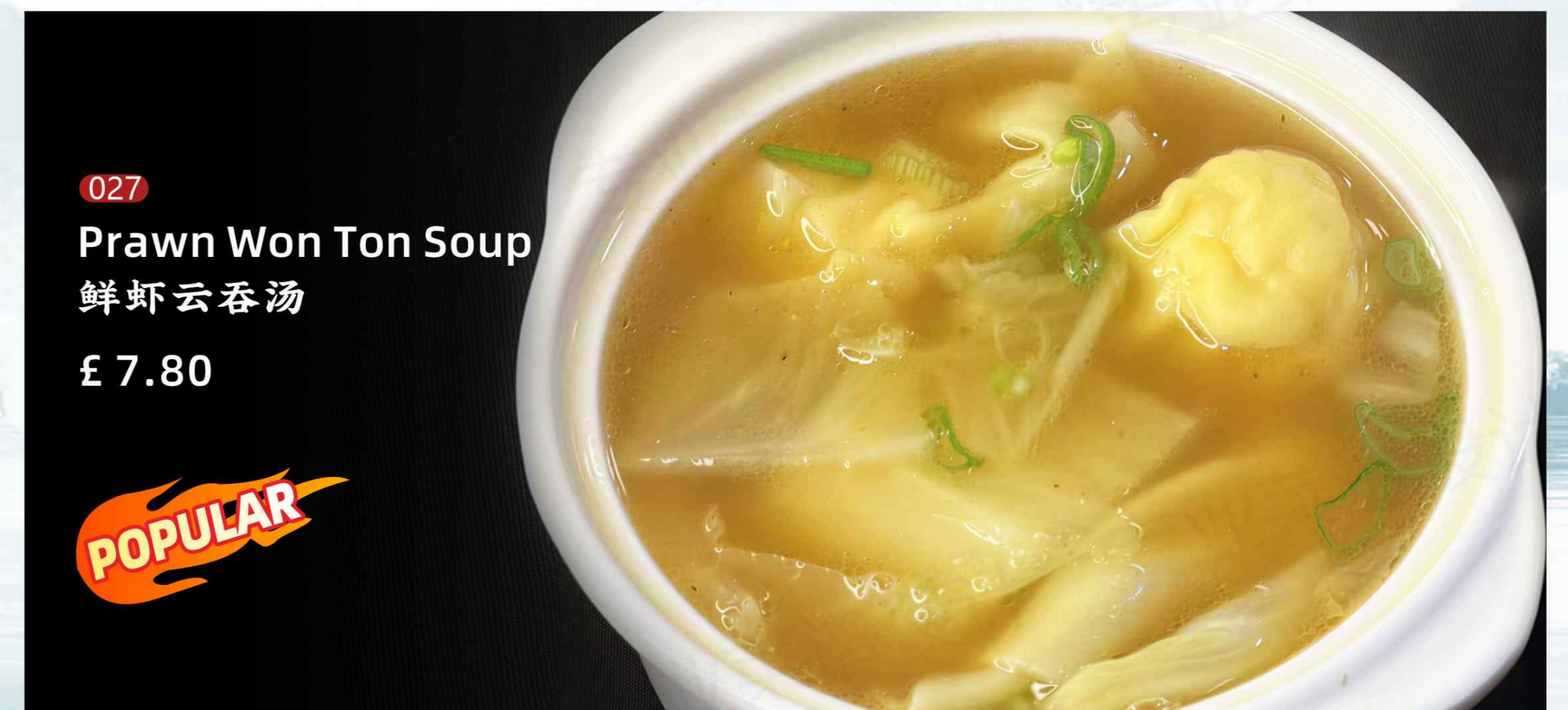
027 Prawn Won Ton Soup 鲜虾云吞汤 £ 7.80