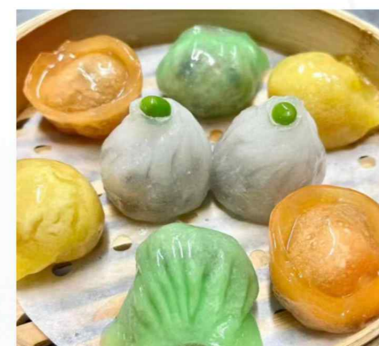
010 Vegetarian selection 斋点心拼