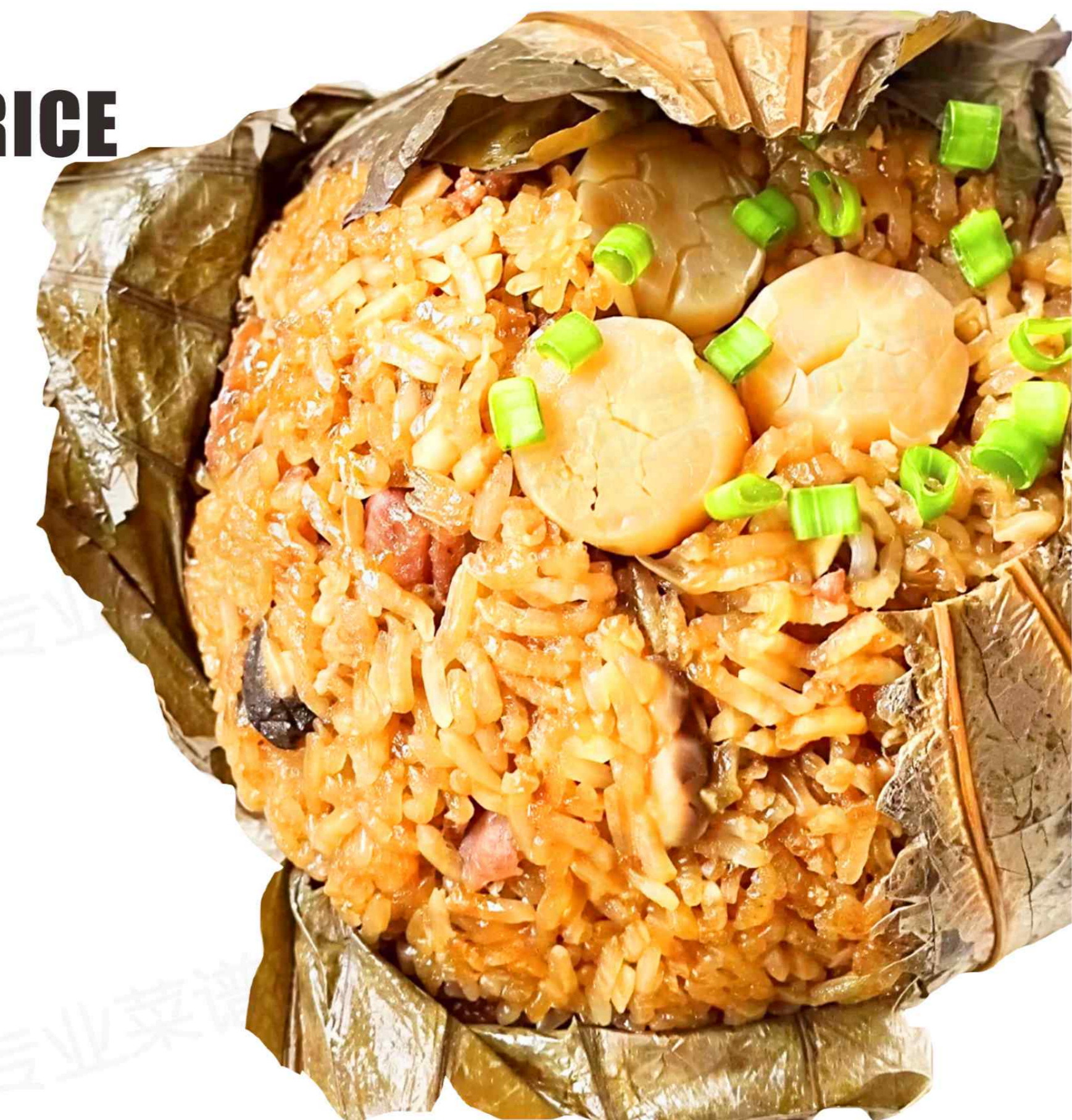
082 Seafood rice steamed in lotus leaves 荷叶海鲜饭 £ 17.99