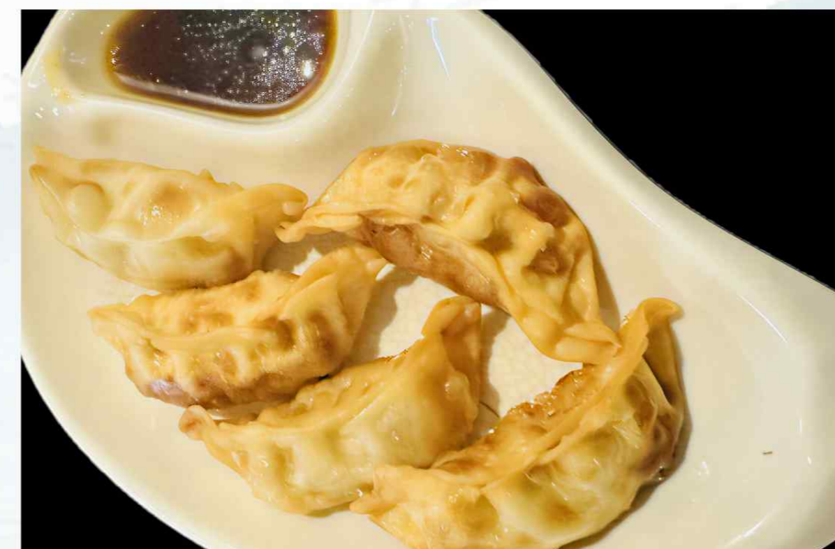
022 Deep fried dumplings