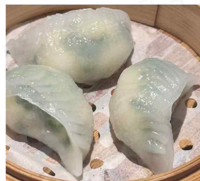
003 Steamed prawn and chive dumpling 鲜虾韭菜饺