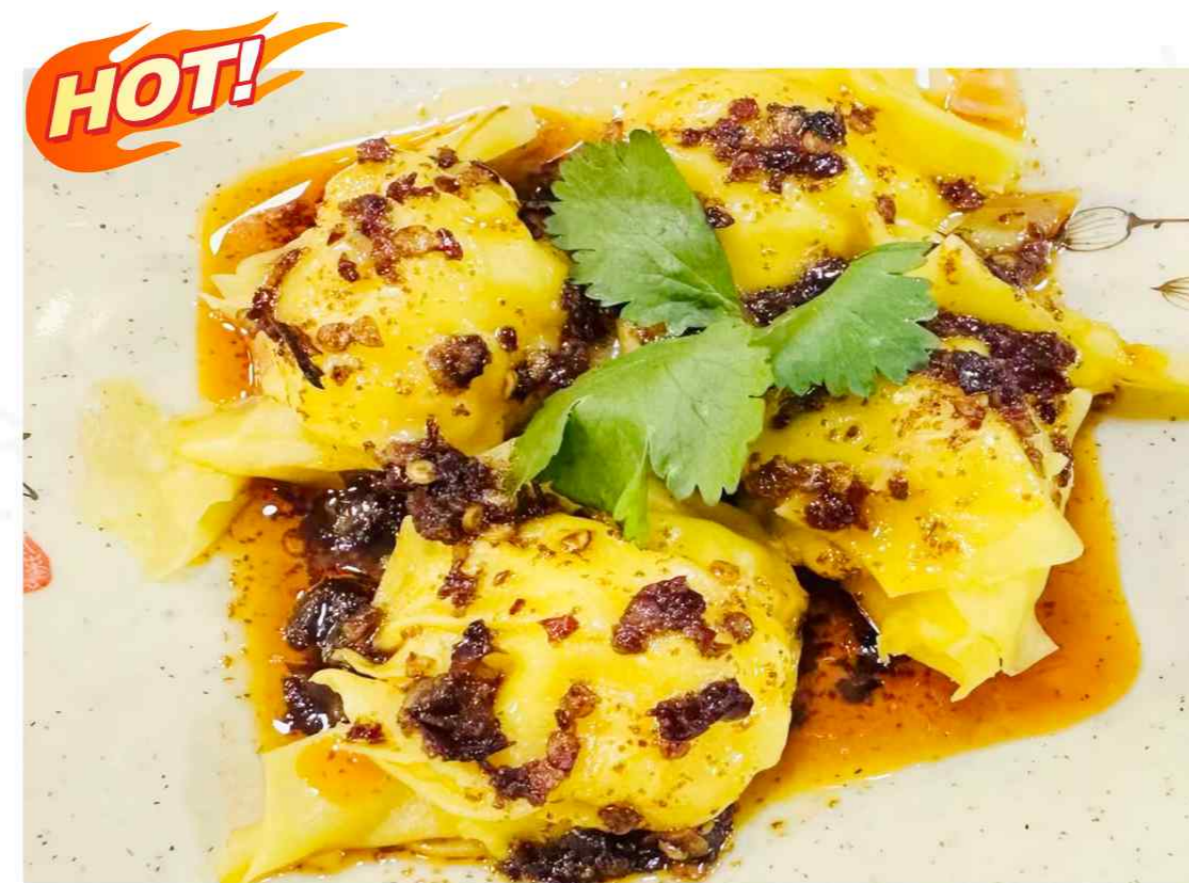
HOT! 007 Prawn Dumpling in chilli oil (must ordered) 红油水饺