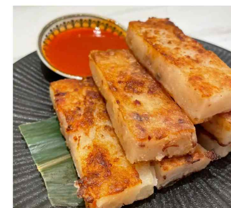
012 Pan fried turnip cake 香煎萝卜糕